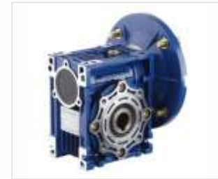
Reduction Gear Box