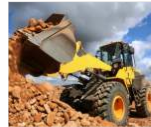
Earth Moving Machineries

Exclusive Exporters & Master Distributor in India :